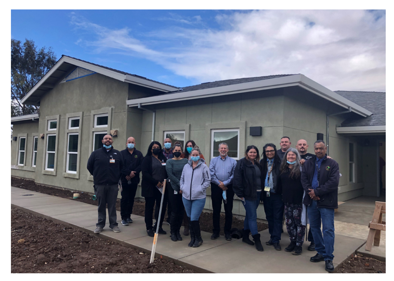
Mission Merced led a tour of the new 32-bed Hope Respite Care facility for the Social Services Department at Mercy Medical Center Merced.

to permanent supportive and affordable housing units. The pet-friendly center also has kitchen and dining facilities, laundry, classroom, and clinic and office space for service providers.