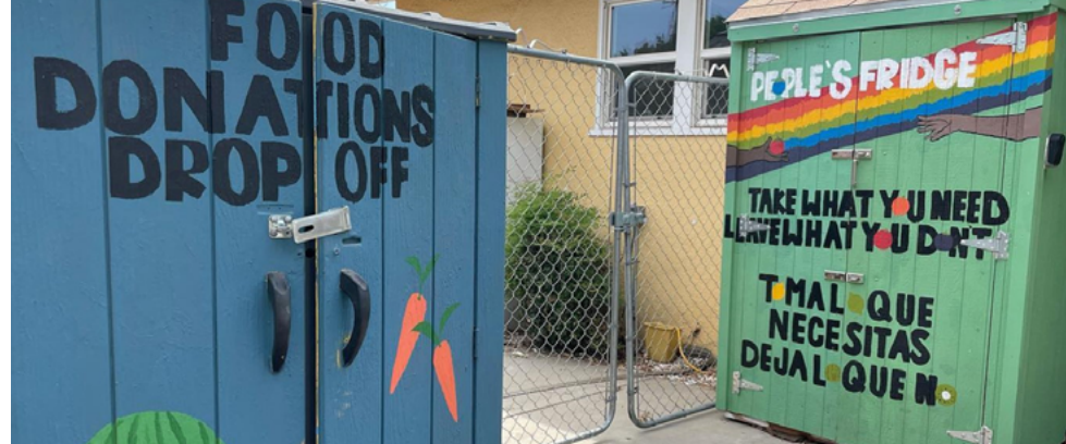
Left: CHI's Food for Families program provides coaching and in-person classes for children and their families on healthy eating and lifestyle. Right: Project Grow operates the People's Fridge, Merced County's first community fridge to provide free, fresh food to all available 24/7.

Food security remained a priority for the Alliance in 2021. Several MCGP grantees implemented projects that helped children and families receive healthy food and develop a healthy lifestyle.